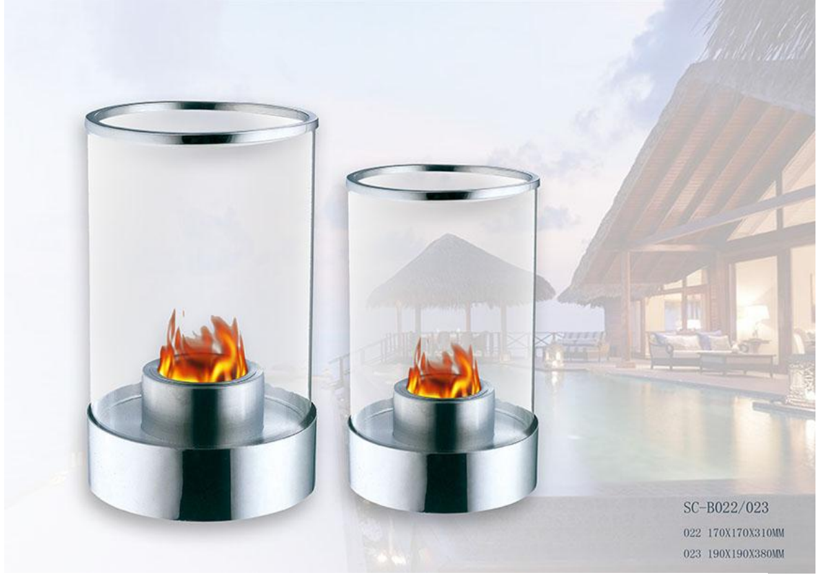
Stainless Steel Taper Candle Holder for party produce process